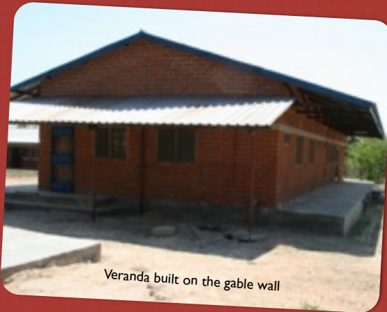
Veranda built on the gable wall