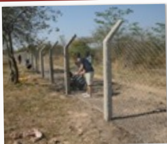
PUTTING UP THE SECURITY FENCE